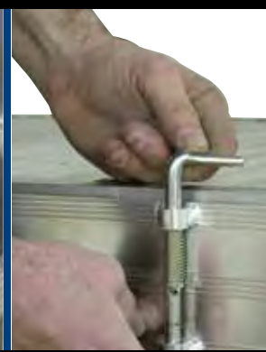
5" double lock casters