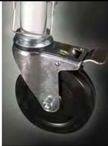
5" double lock casters